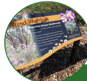
Interactive educational signs