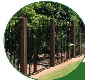
Perimeter fence with swing gates