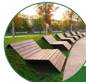
Observation / resting benches