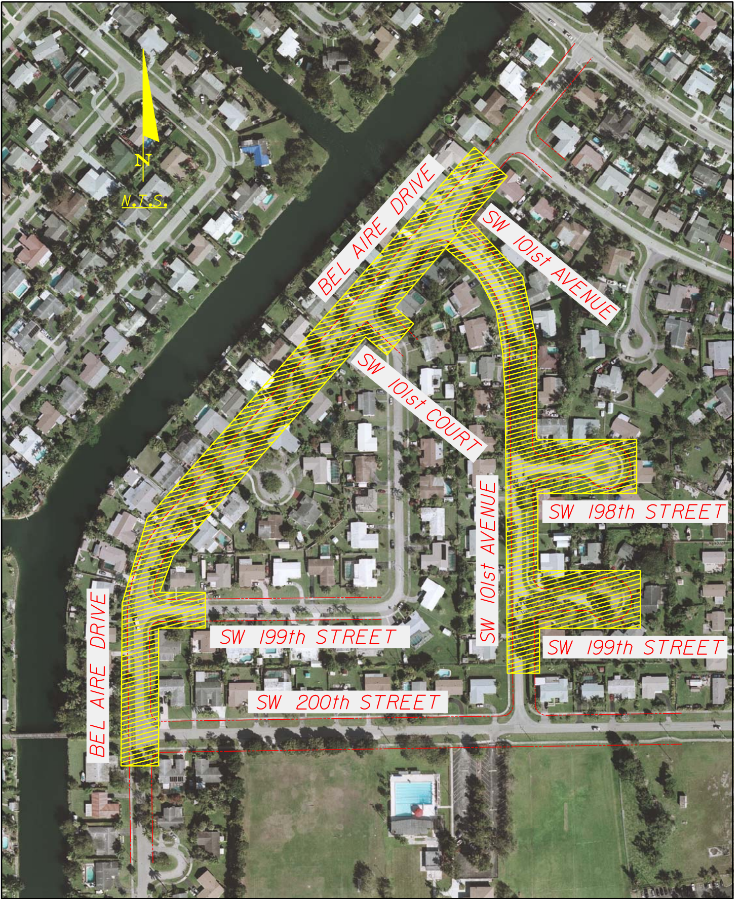
BEL AIRE PROJECT LIMITS